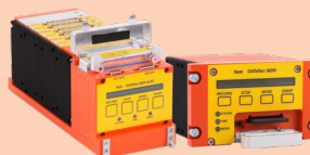
SSD / LAN