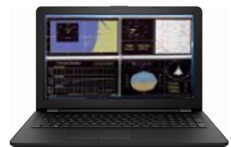
CONTROL AND MONITORING