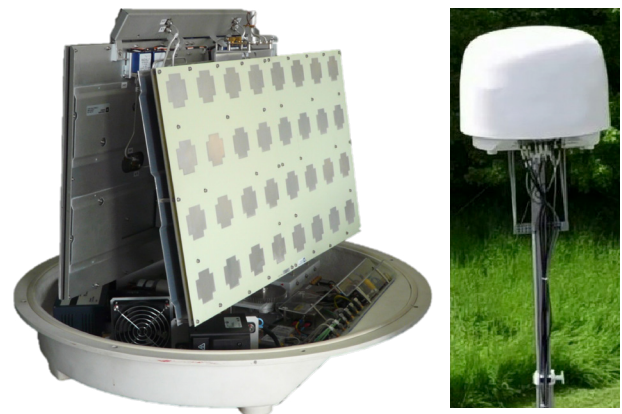
S+C Band COMTRACK

Dimensions ..... 790mm diameter x 635mm height Weight ..... < 35 kg (77lbs) Operating Temperature ..... -40°C to +50°C Storage Temperature ..... with cold start at -35°C Relative Humidity ..... MIL-STD-810G method 507.5 Environment Protection ..... IP63 / CE marking Wind ..... Up to 180 km/h Power Supply ..... 115V or 230 VAC +/-5%, 50-60 Hz Power Consumption ..... Typical 150W, maximum 750W Vibration ..... MIL-STD-810G method 514.6 Transport Case ..... 840 x 840 x 708 mm (33" x 33" x 28")